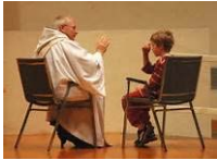
Reconciliation Meeting Saints Feb. 26 th

Parish Center 11am (after Mass) for all Sacrament Meetings!